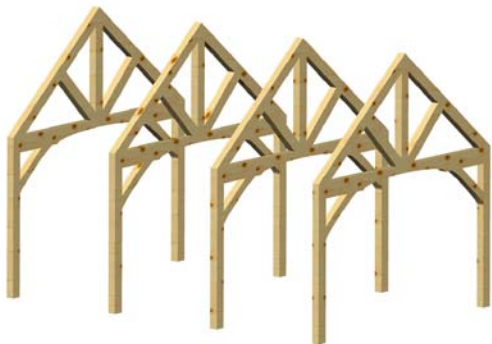
AVAILABLE HYBRID TIMBER TRUSSES, POSTS AND BEAMS OPTION